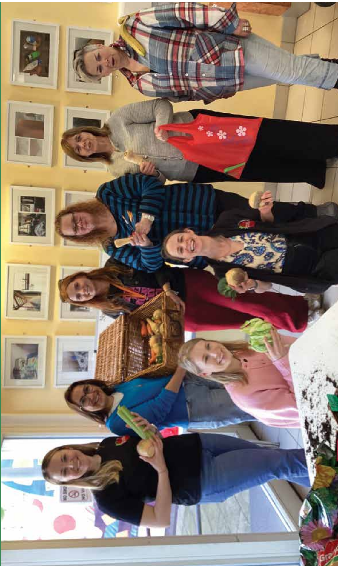
Nourishing Nurseries event