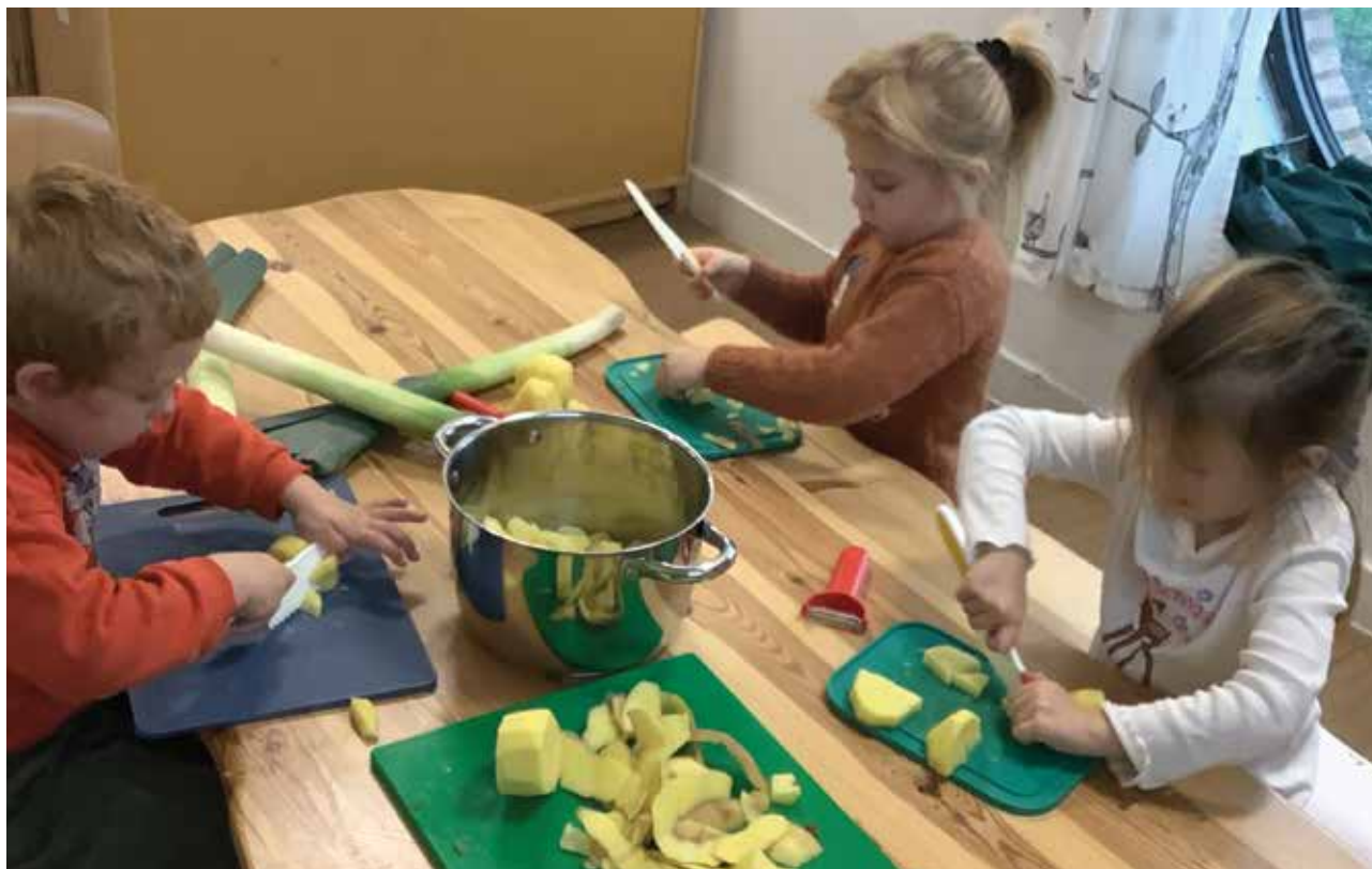
GEYC preparing vegetables for soup