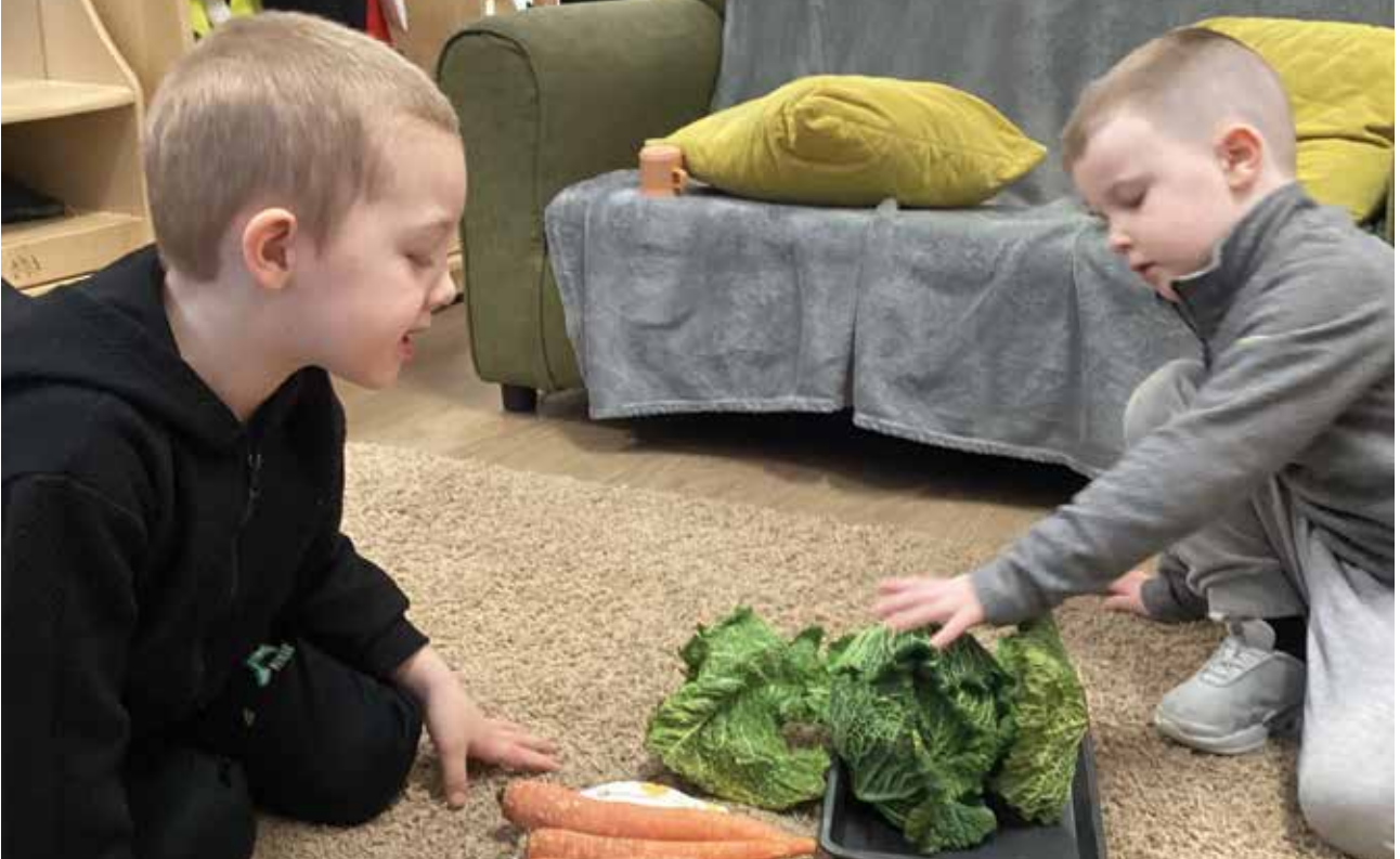
GEYC exploring new vegetables