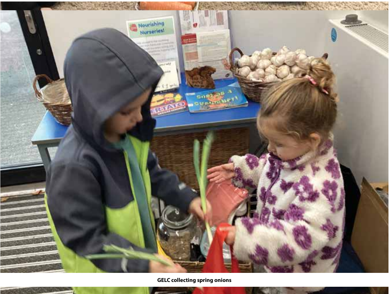
GELC collecting spring onions