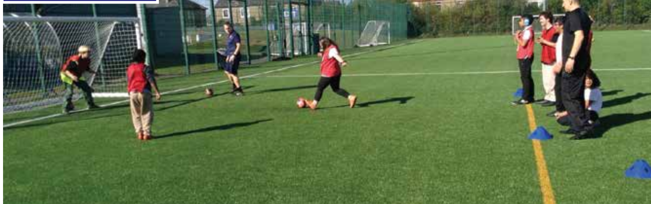
Football training with Spartans Community Football Club every Thursday afternoon