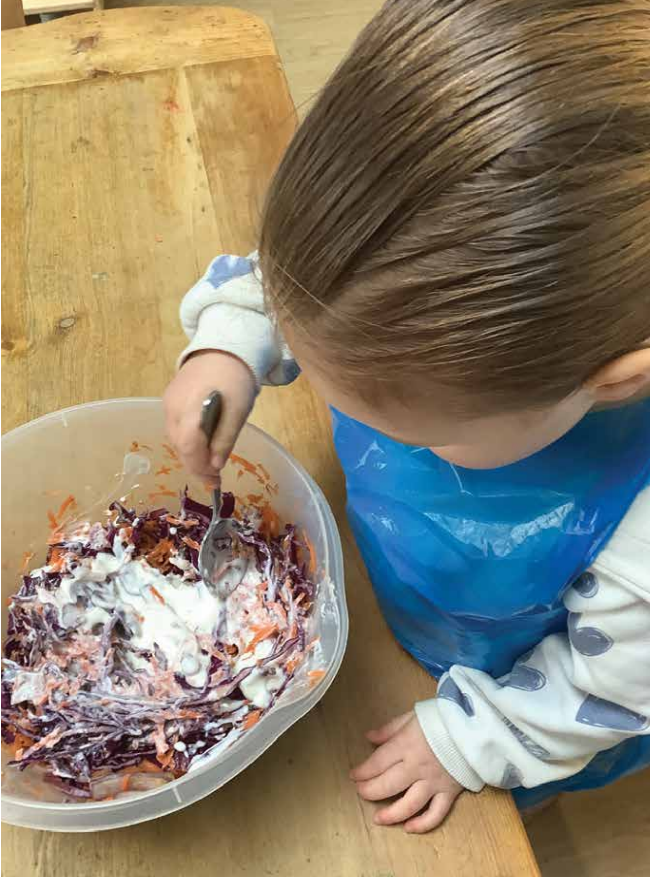
GELC mixing coleslaw using red cabbage and carrots