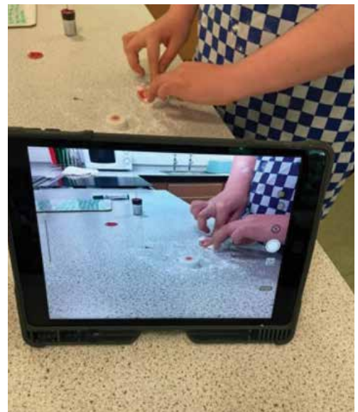
FTT using iMovie to create pizza adverts

Digital Leaders played a key role by gathering evidence, contributing to the