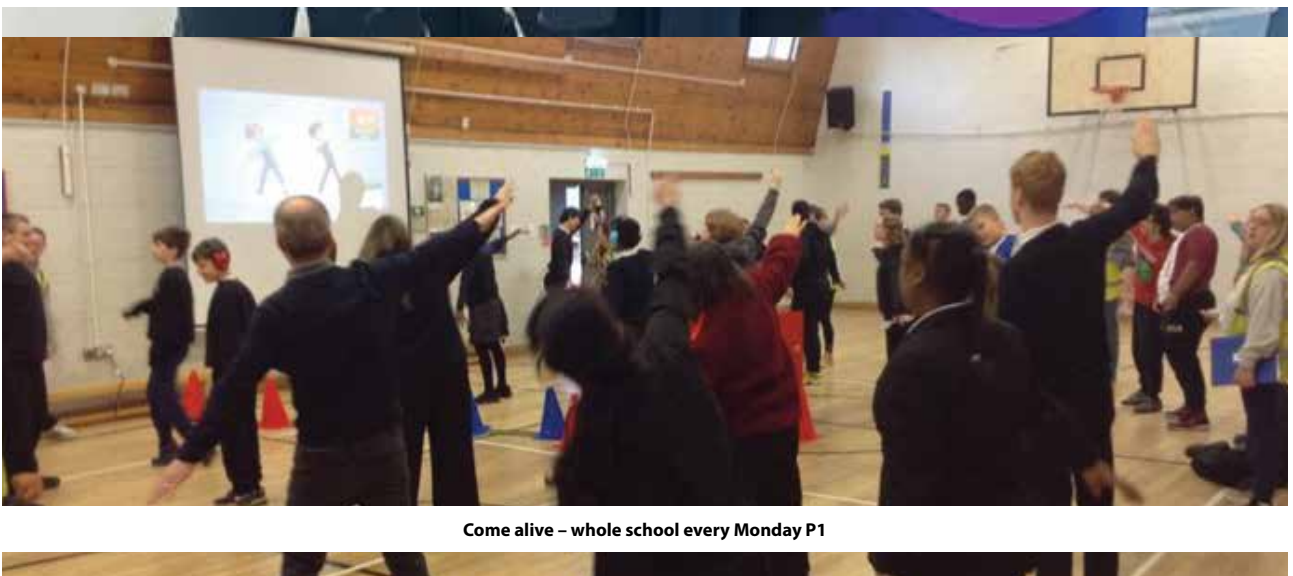
Come alive – whole school every Monday P1