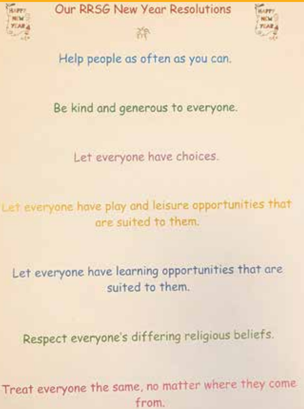
Resolutions the Rights Respecting New Year's Resolutions that the group came up with which are displayed on our RRSG board in the school foyer.