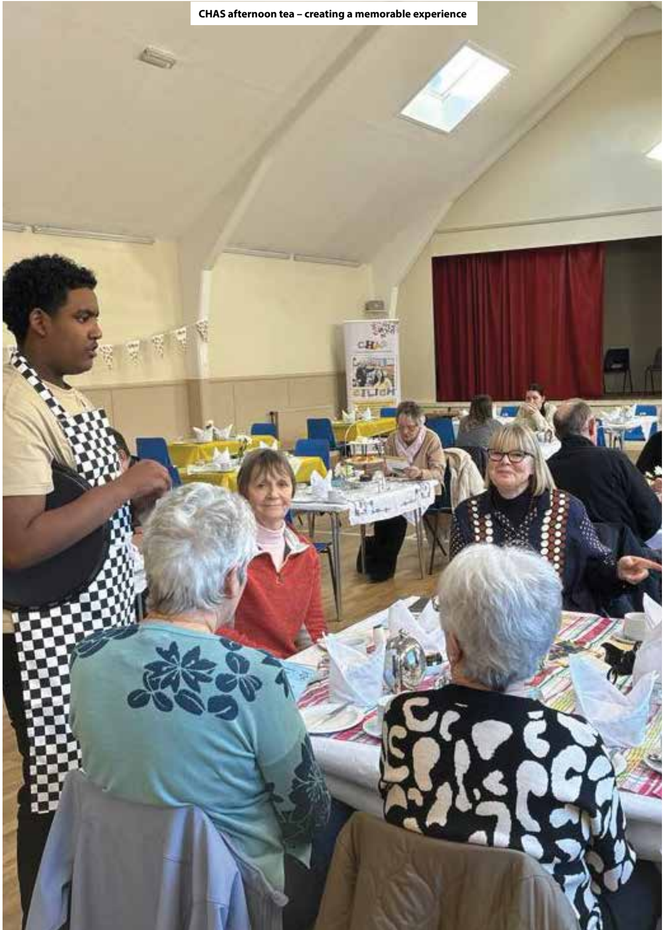
Celebrating Our Pupils' Success: An Afternoon Tea for CHAS