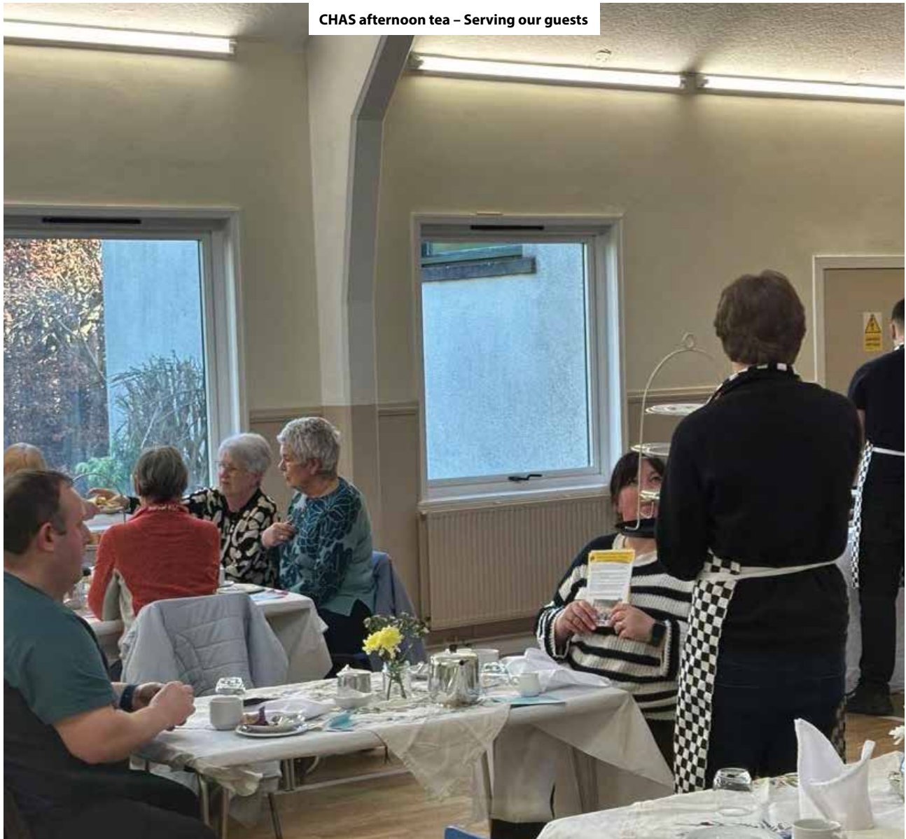
CHAS afternoon tea – Serving our guests