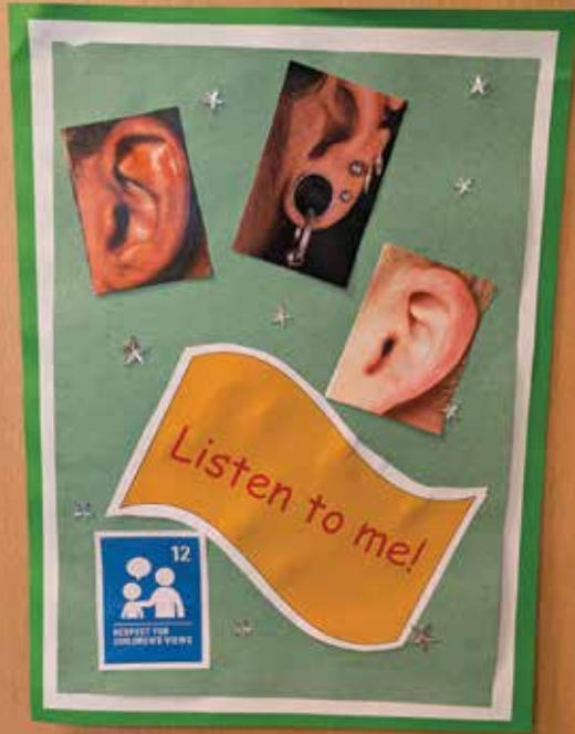
Listen to me poster and example of one of the posters made by the group.